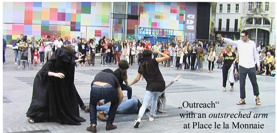
„Outreach“ with an outstretched arm at Place le la Monnaie

Send your requests to: pastor @ alcb.be and specify whether it is private or to be shared.